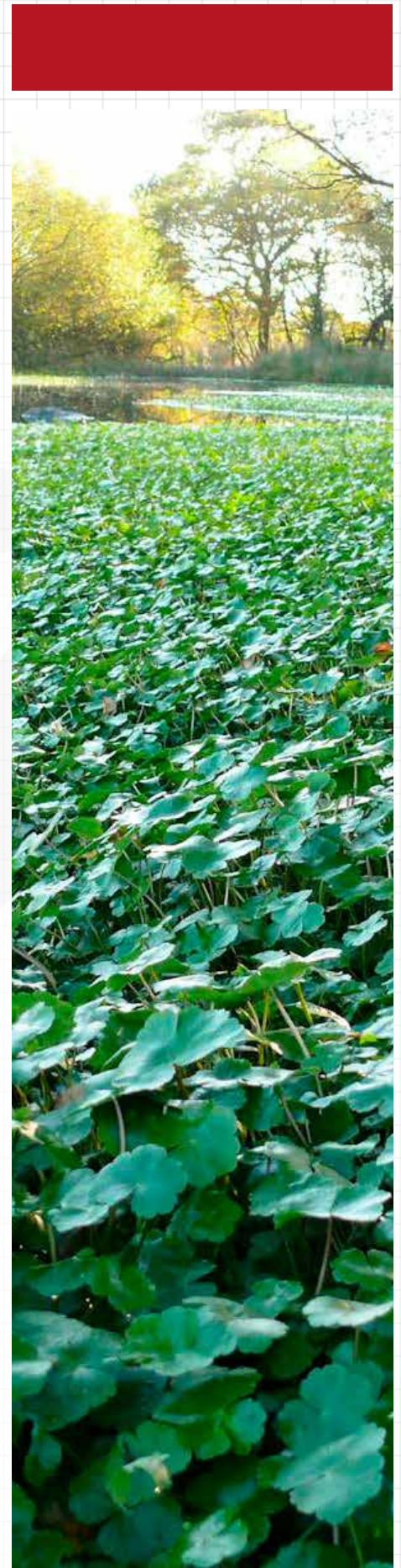
Floating pennywort taking over a waterbody