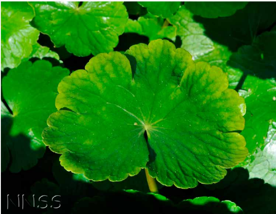
Green kidney shaped leaves