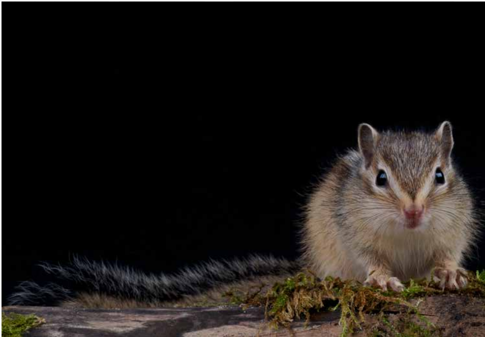
Frontal view of a Siberian chipmunk notice the tail which is one third the length of the entire animal