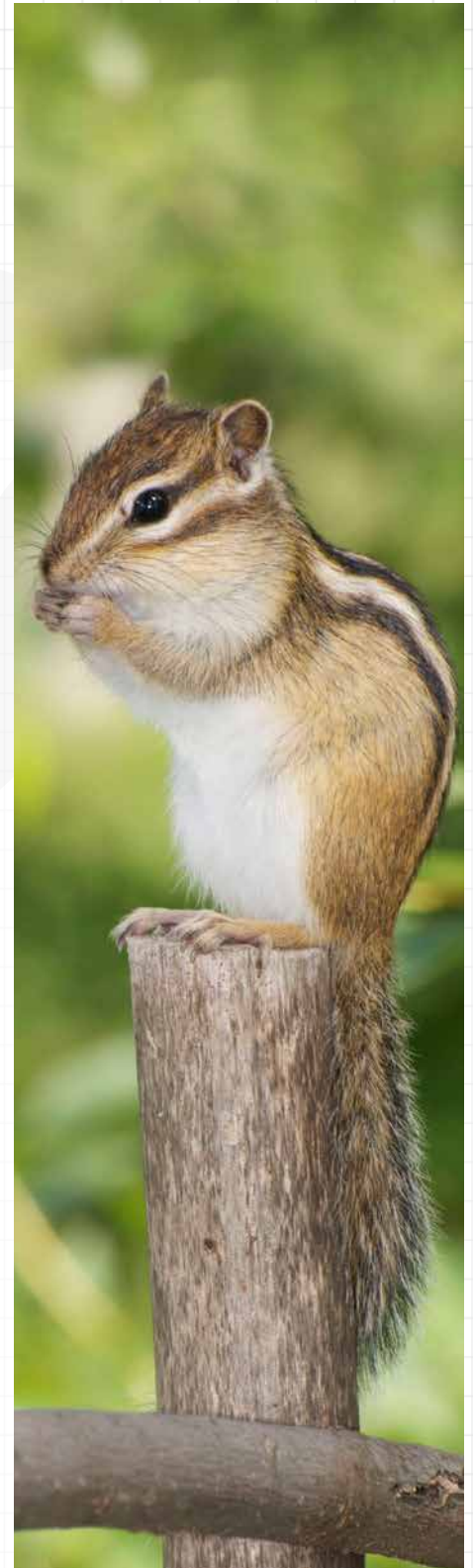
A Siberian chipmunk perched on a fence while feeding. Dark stripes visible on back