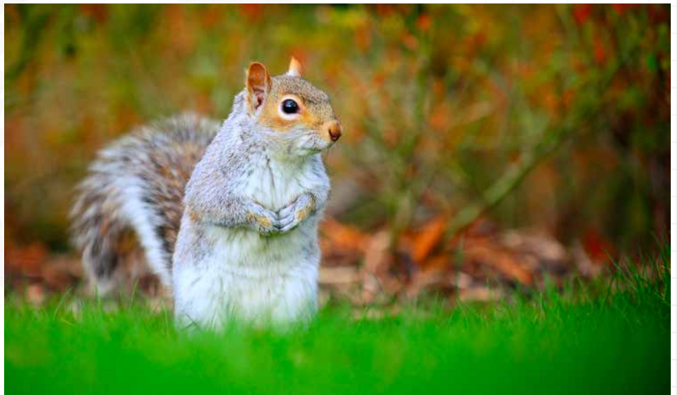
Grey squirrel showing pale coat and white underside