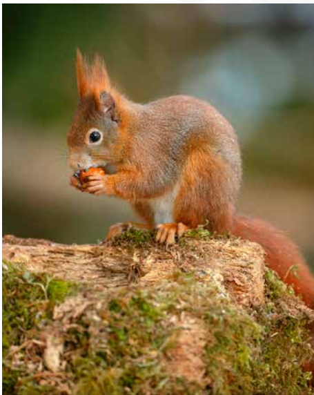
The red squirrel showing its colouring and distinctive ear tufts