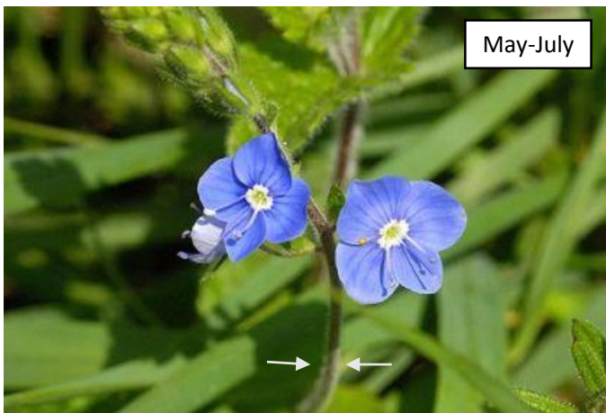
Hedgerows, grassland, woodland