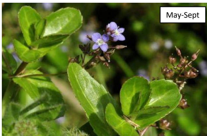
Shallow standing water

In 4 species the flowers are in spikes and the main stem ends in a tuft of hairless leaves. These species occur in wet habitats