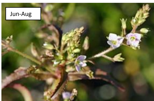
Wet ground, marshes, shallow ditches