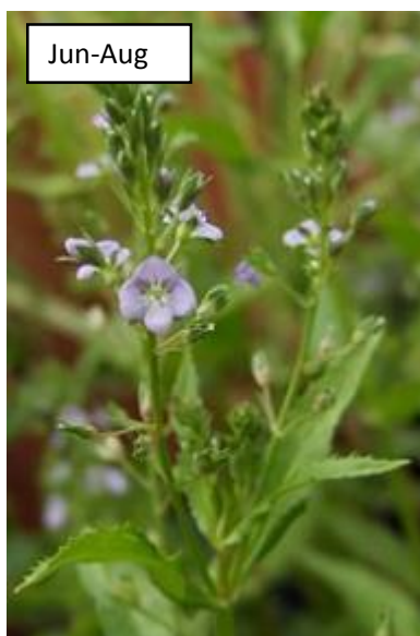
Wet ground, marshes, shallow ditches