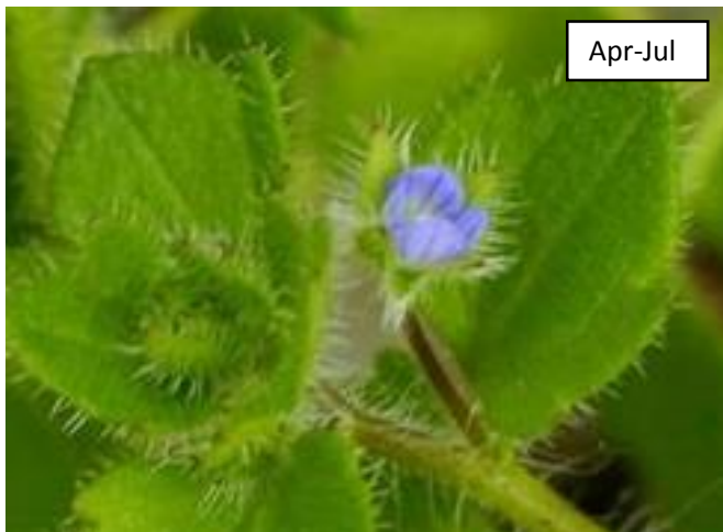
Bare, disturbed ground