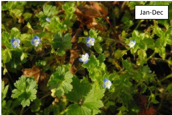
Bare soil, waste ground