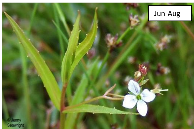
Damp, boggy ground