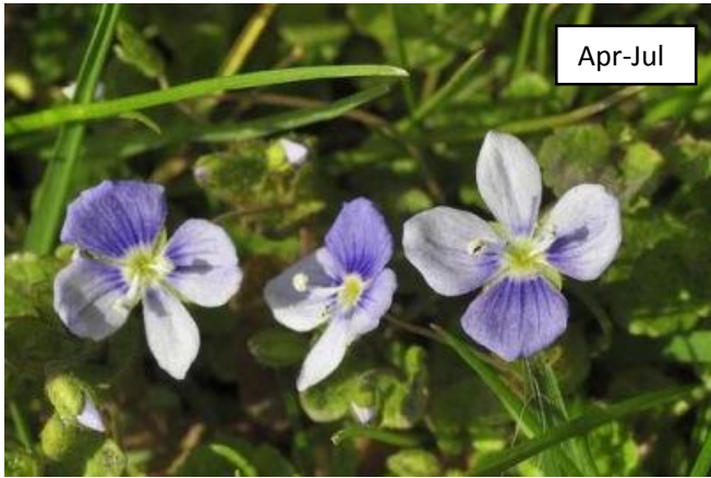
Lawns, short grassland