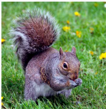
Grey squirrel showing a darker coat which may cause confusion between the native red squirrel if seen at a glimpse