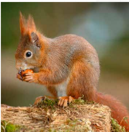
The native red squirrel showing its colouring and distinctive ear tufts

Most similar to the red squirrel especially when the grey squirrel is in its winter coat.