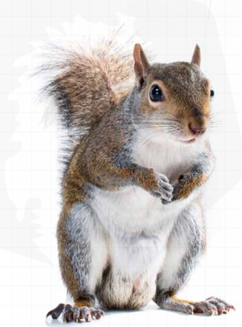
No tufts of hair coming from ears which is a distinguishing feature of the red squirrel.