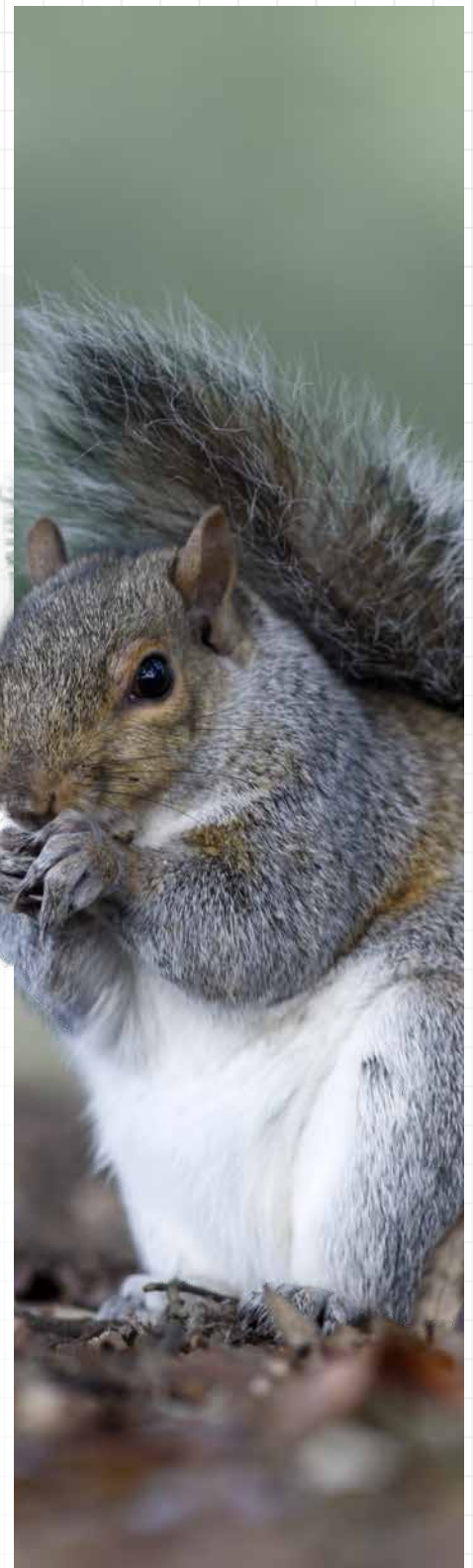
Grey-silver with brown coat accompanied with a white underbelly are distinctive qualities of the grey squirrel