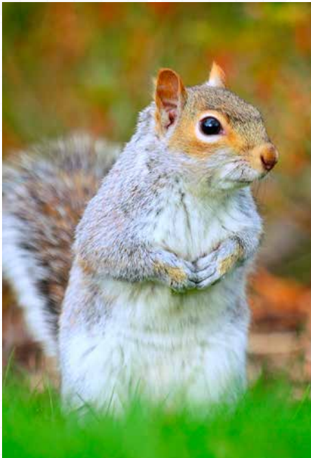
Grey squirrel showing pale coat and white underside