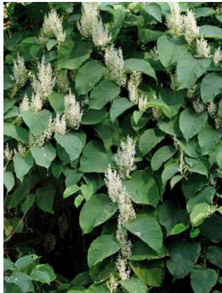
Japanese knotweed in flower