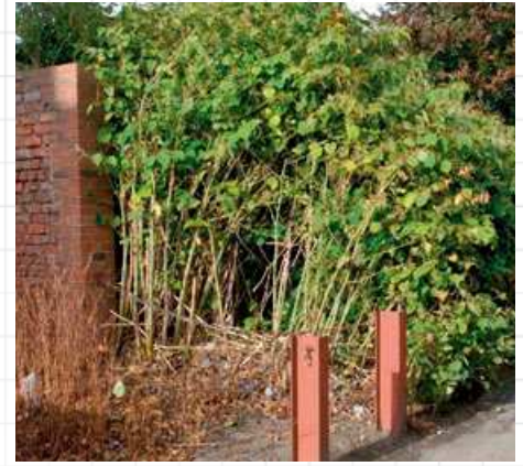
Japanese knotweed growing in an urban area