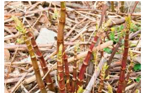
Newly emerging Japanese knotweed