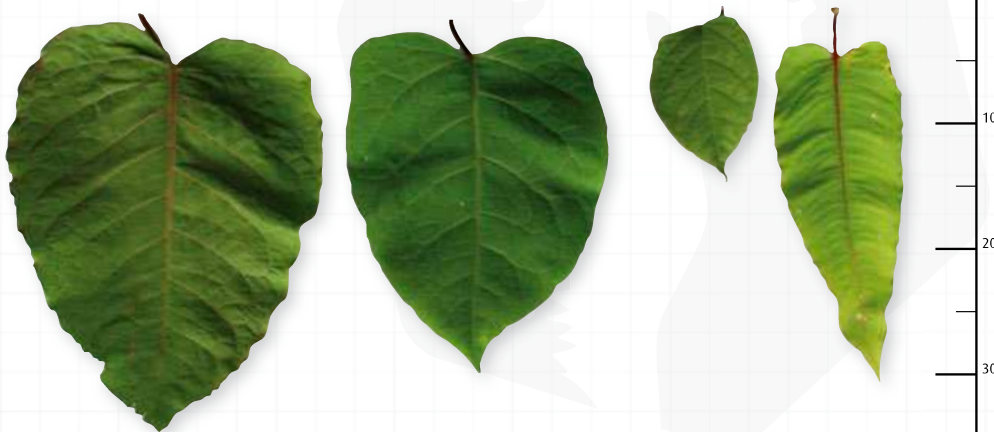
Comparison of leaves (from left to right) giant knotweed, hybrid knotweed, Japanese knotweed, Himalayan knotweed".

An Chomhairle Oidhreachta The Heritage Council