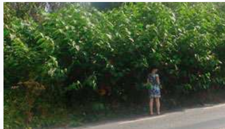
A stand of giant knotweed along a road side

Himalayan knotweed ( Persicaria wallichii )