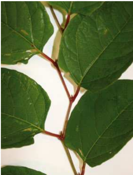
Stem is zig-zag formation