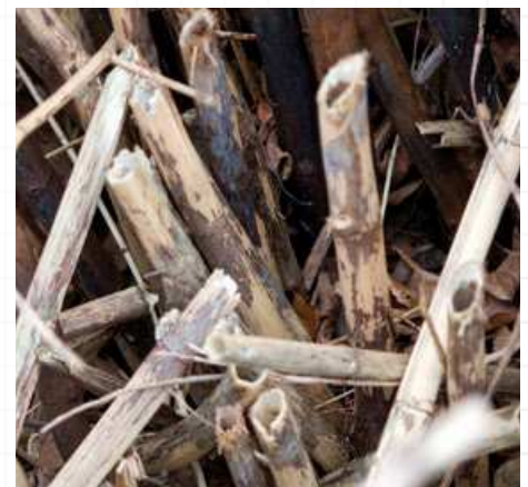
Dead hollow stems of Japanese knotweed