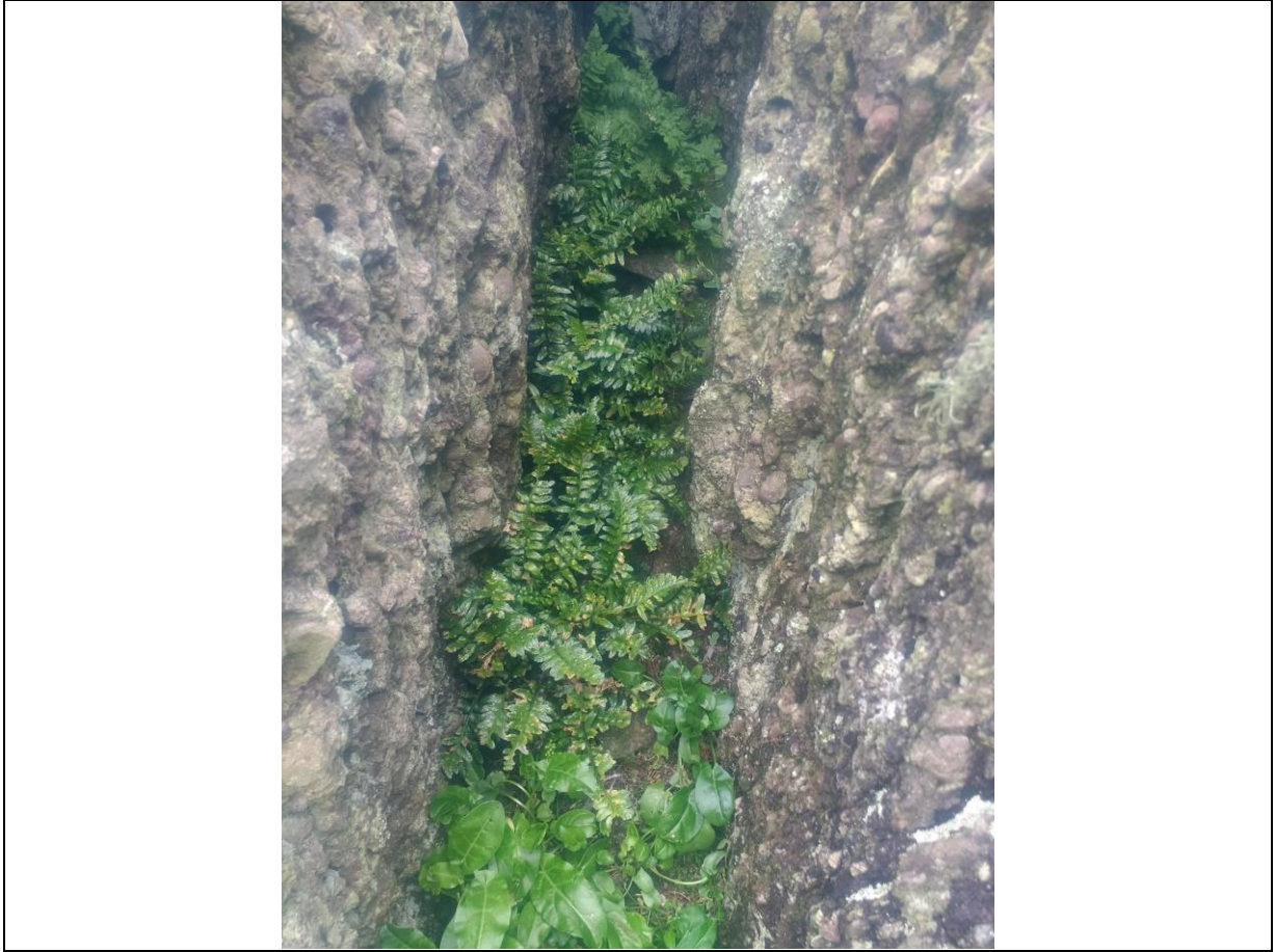
Photo 1. Vegetation ascribable to RH4A Asplenium marinum crevice community, Inishtooskert, Kerry (R. Hodd, June 2018)