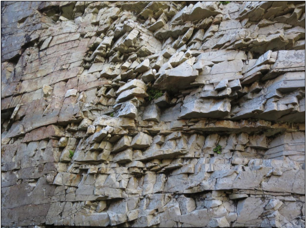
Photo 2. Vegetation ascribable to RH4A Asplenium marinum crevice community, Slieve Tooley, Donegal (R. Hodd, August 2017)